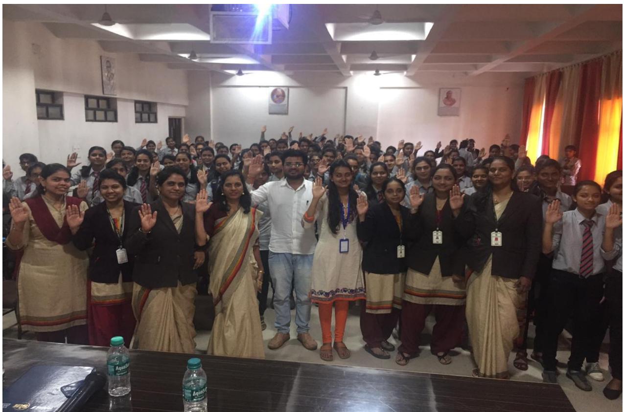
Group photo of students and staff members of GCOERC and Representatives of Step-up Foundation