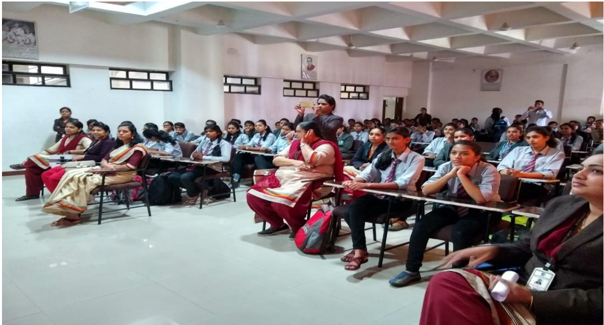
Girl students as well as ladies staff members attending the session